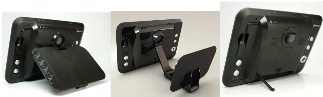
Extendable Stand (folded)